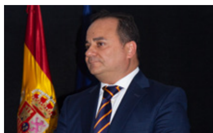
P. 5 NATIONAL DAY OF SPAIN