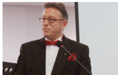
P. 11 NATIONAL DAY OF AUSTRIA